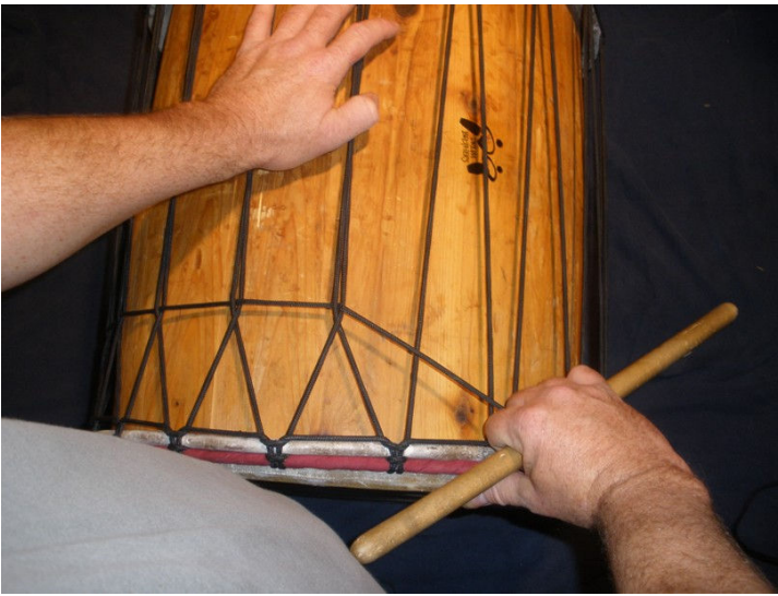
The finished overlap.

When you master the weave pattern, you can weave many pairs of vertical ropes in one sitting and then go back and overlap and tighten them one by one. This can save you a lot of time when tightening a new drum or a really loose head.