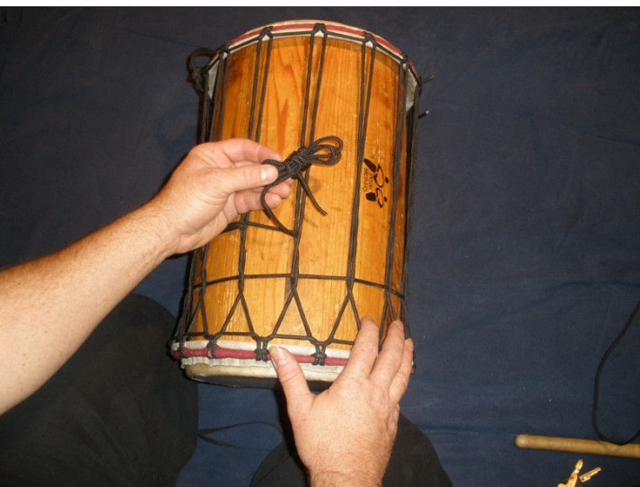
For some drums, you can bundle the extra rope together ...

Finishing up: When your drum is tightened to your liking, weave one extra pattern. Rather, than pulling it into an overlap, just snug it up like the picture to the right. This will hold your work in place and leave a correct weave for you to begin with next time.