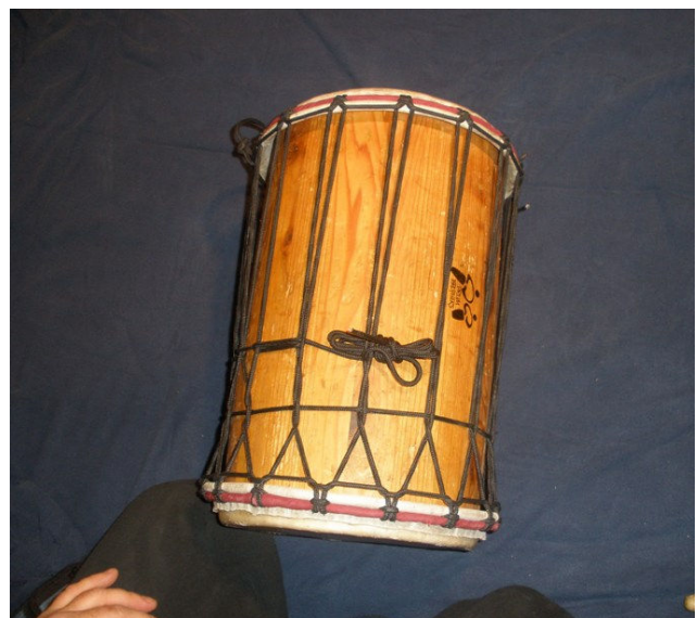
and then tuck it under the vertical ropes. Or just wrap the extra around the drum.