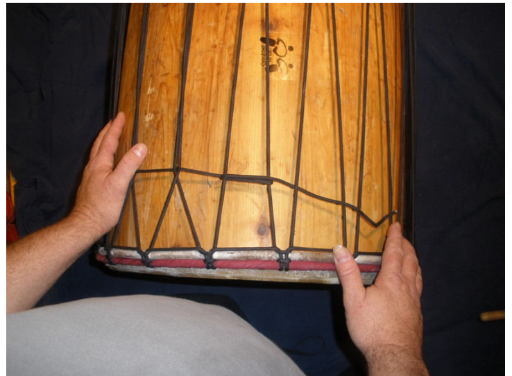
When you're finished, add one extra weave to hold things in place.

Warning: When following the pattern, "under two, back under the first", make sure to go under the first rope from the correct side. If you go back over and then under the first rope by mistake, you won't be able to correctly overlap and tighten. Try it the wrong way once, and you'll see what I mean.